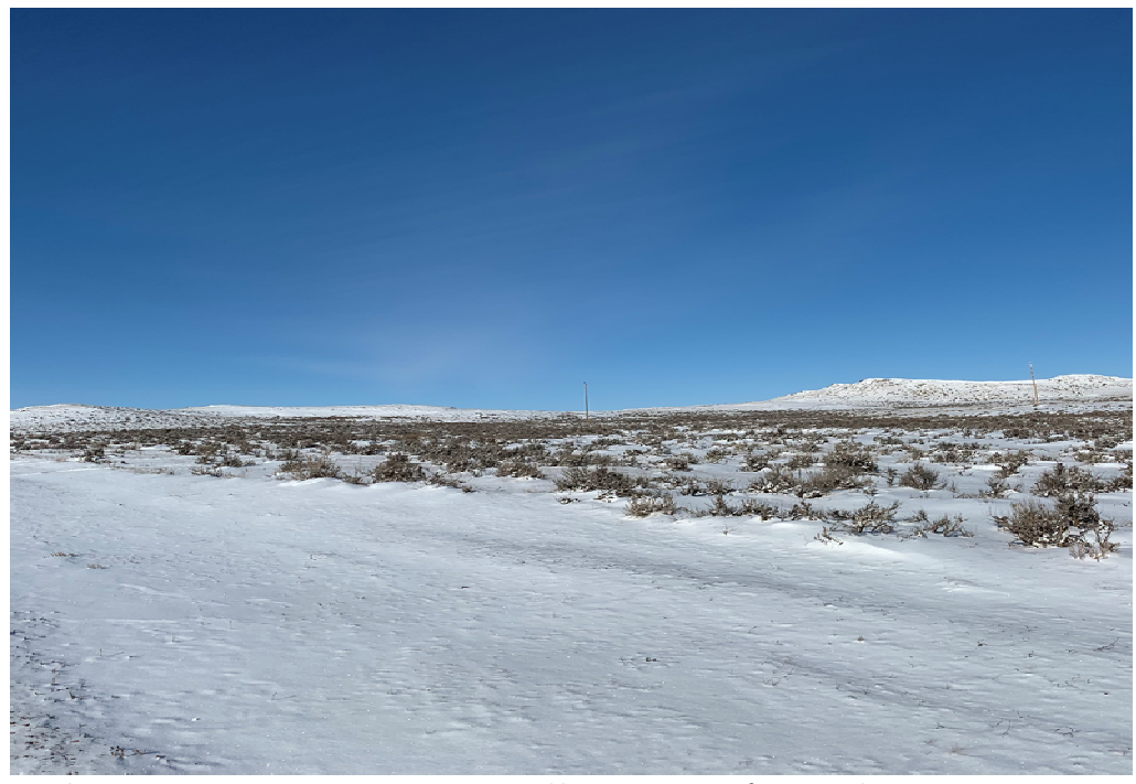
Powder River Basin Wyoming in winter – proposed location on one of Eon NRG leases.

Eon NRG Ltd's ("Eon" or "the Company") acquisition of 15,000 acres in the Powder River Basin ("PRB") was finalized with executed leases received from the Bureau of Land Management (BLM). The leases were financed from existing cash reserves. Management has continued with its geological and economic assessment to identify several high value drilling opportunities. Onsite visits were performed to evaluate surface topography and well pad design of potential prospects. Environmental/archology contractors have initiated regional reviews and preliminary permitting for new wells.